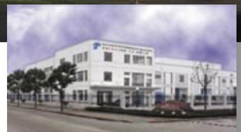
Antunes Equipment Manufacturing (Suzhou) Co. Ltd.

A.J. Antunes & Co. is a family owned and operated manufacturer. Our reputation in the industry has been built on maintaining the highest standards of quality and service in each product line that we manufacture. Consider the problems and needs of your operation and decide for yourself which company can give you the right solution. We invite you to challenge us.